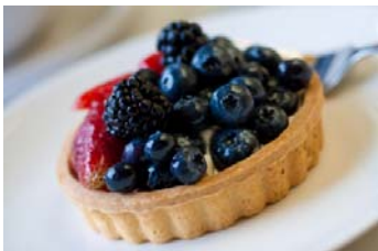
Pick up or Delivery?

Our goal is to make online ordering easily available to restaurants via our cost-effective and customizable solution.